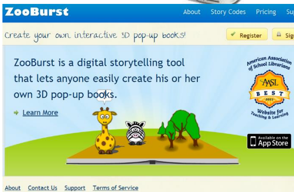
Figure 2. Workshop highlights