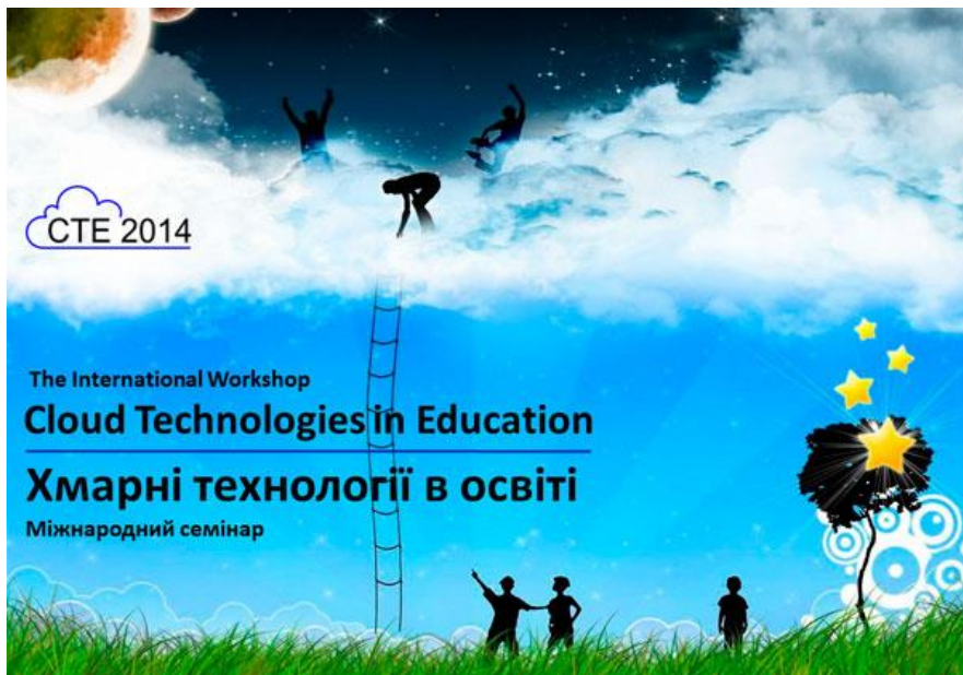
Figure 1. CTE 2014 logo and cover.