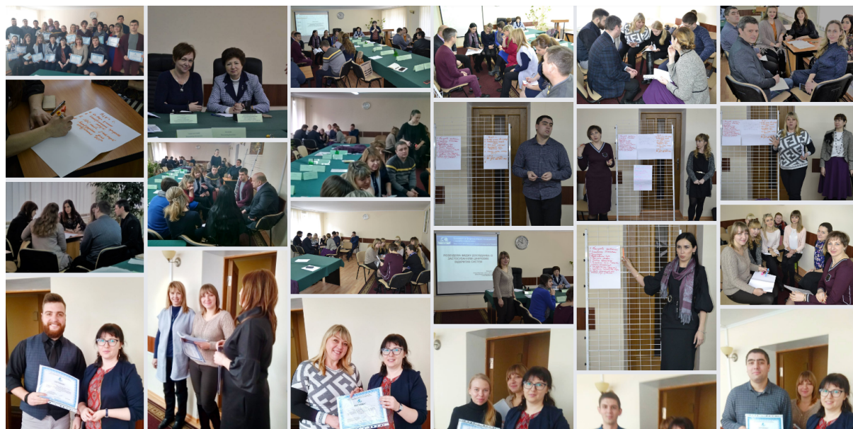
Figure 1. The pedagogical experiment on the basis of Vinnytsia Mykhailo Kotsiubynskyi State Pedagogical University.

The author’s methodological system was implemented in universities and research institutions directly by the authors of this research, and the management and teaching staff of these institutions were involved. Important component of the methodological system was the author’s set of seminars and workshops with digital systems use. It was aimed to develop informational and research competencies of postgraduate and doctoral students. After completion of the formative stage of the pedagogical experiment, Assessment of development levels (control section) of informational and research competencies of postgraduate and doctoral students was re-performed according to special diagnostic tools after completion of the formative stage of the pedagogical experiment. For example, photos in figure 1 are taken after the pedagogical experiment on the basis of Vinnytsia Mykhailo Kotsiubynskyi State Pedagogical University.