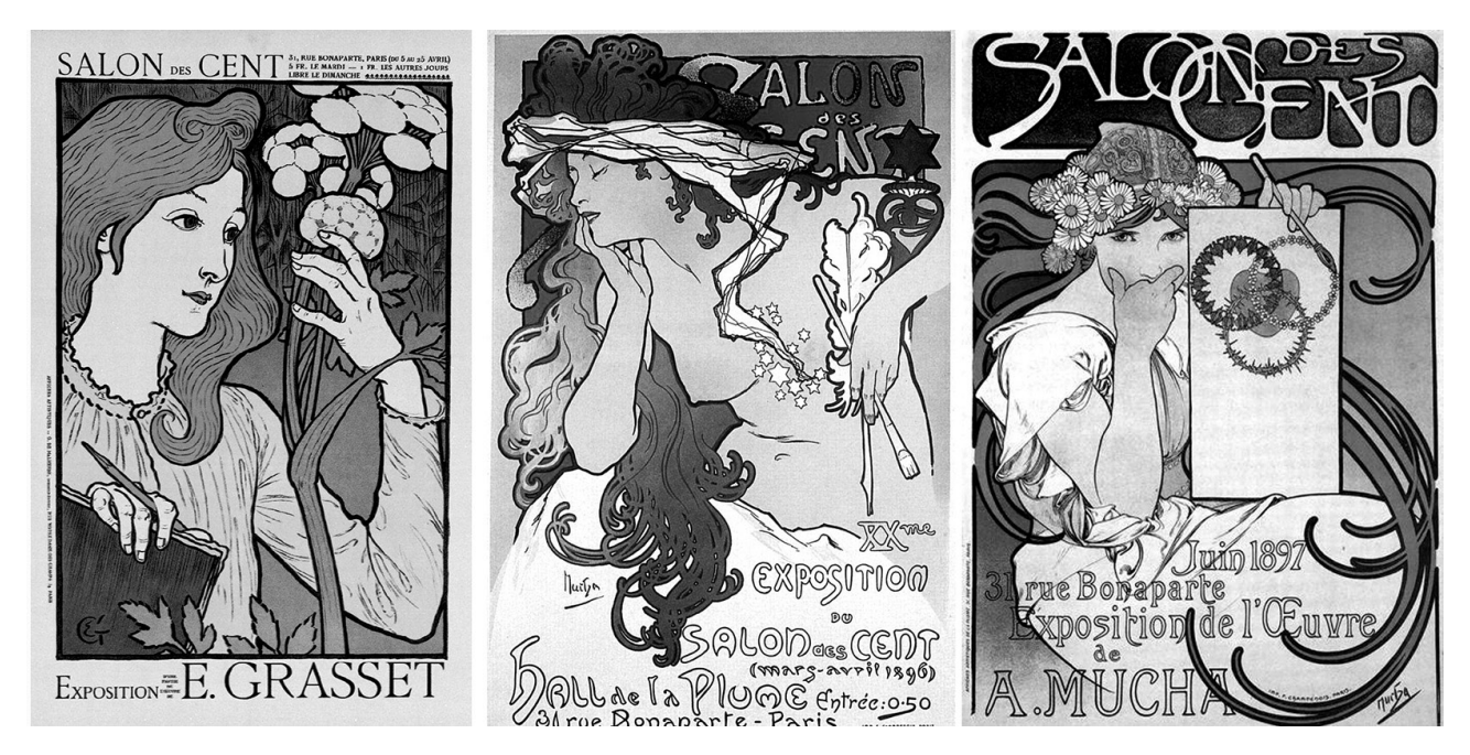
Figure 6. Exhibition posters of E. Grasset and A. Mucha (from left to right), in which decorative and symbolic approaches to create artistic image were used