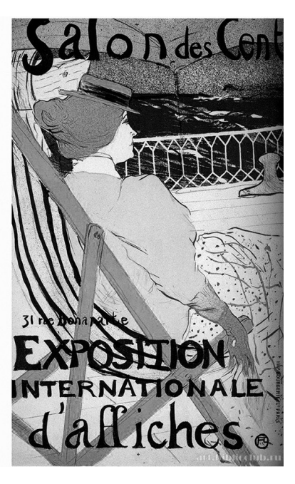
Figure 5. Exhibition posters of H.-G. Ibels, F.-A. Cazals, H. Toulouse-Lautrec (from left to right), in which a theme based approach to create artistic image was used