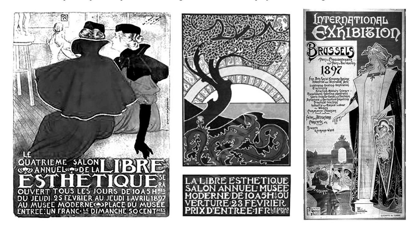
Figure 3. Exhibition posters of Belgian designers T. van Rysselberghe, Gisbert Combaz, H. Privat-Livemont (from left to right)

is perceived as a separate part and another place is given for the text. Therefore, the poster is no longer just a graphic sheet with a randomly placed text, it is an object of graphic design (Fig. 4). The careful treatment of fonts as a complete equal component with image is observed in the projects of the Belgian authors.