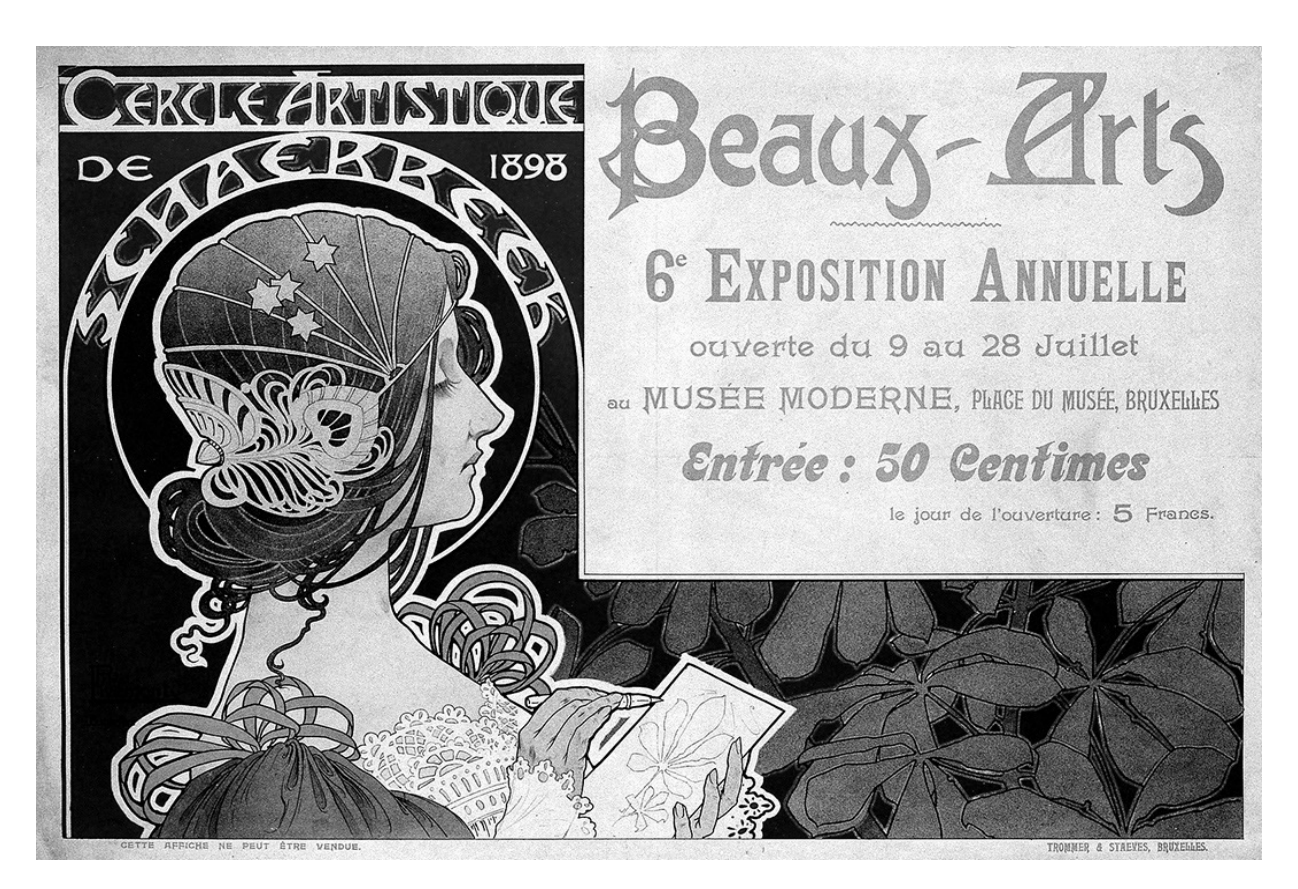
Figure 4. H. Privat-Livemont. Poster of the Artistique exhibition. 1898