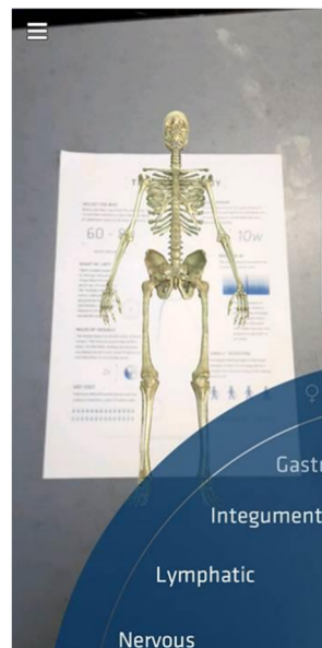
Fig. 2. Example of using AR in education

However, the potential of Google Expedition is not limited by using in the Elementary School. This technology can be used for visualizing of anatomy, astronomy and other environmental sciences. The example of using AR in education is present on Fig. 2.