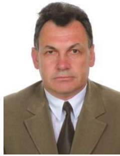
Figure 11. Professor O. I. Oleinikov

O. I. Oleinikov ( Oleinikov & Mogilnikov, 2002 ) proved the theory of unity of a solution for the model of heterogeneous-elastic material for geometrically linear arrangement of the boundary value problem of the elasticity theory on the basis of precise solution of inequalities of local convexity of elastic potential and stability and established necessary and sufficient conditions for the stability postulate to build the model. He analyzed unity and stability conditions for an individual case – the model of loose material – and built their geometrical interpretation. O. I. Oleinikov was engaged into implementing the method of boundary elements into calculating the stress-strain state of rocks.