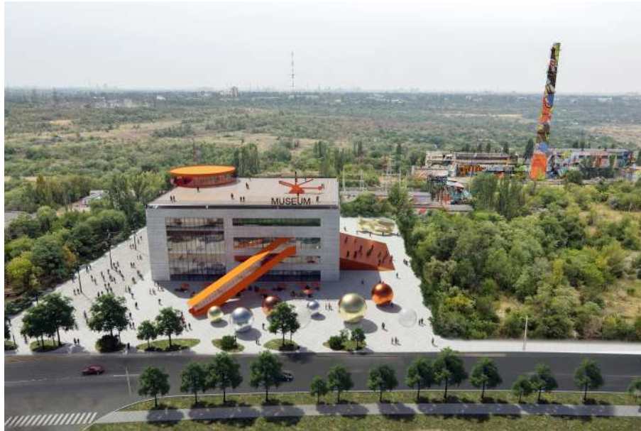
Figure 6. Project of creating an interactive industrial museum and scientific and educational Experimentarium [20].