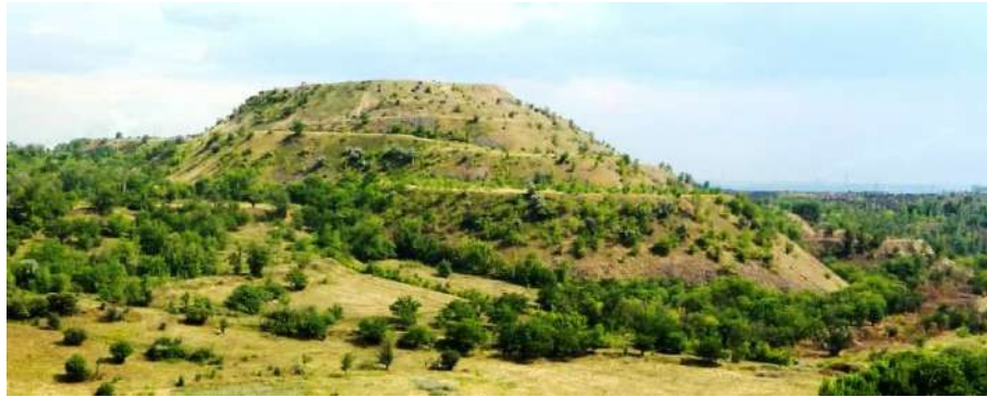
Figure 1. The Burshchytsky dump.