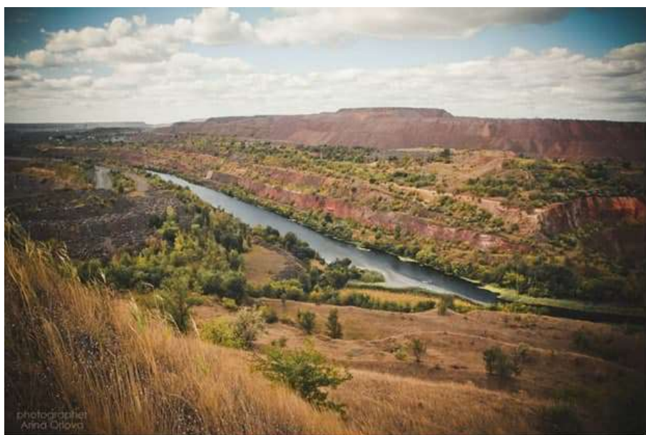
Figure 2. The canal of the Inhulets River and panorama of man-made landscapes from the Burshchytsky dump.