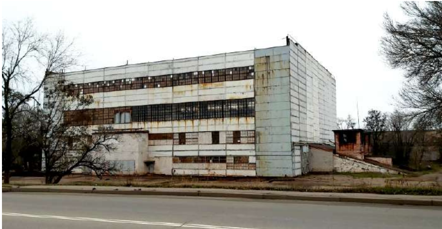
Figure 4. External view of the underground mine “Artem-2”.

“Artem-2” is unique, even within Kryvyi Rih because ore was transported on the daylight surface not by the traditional vertical skip mechanism, but by two belt conveyors installed in inclined (not vertical) shafts (figure 5). In addition to them, the deposit named after Kirov was also opened by a number of vertical shafts.