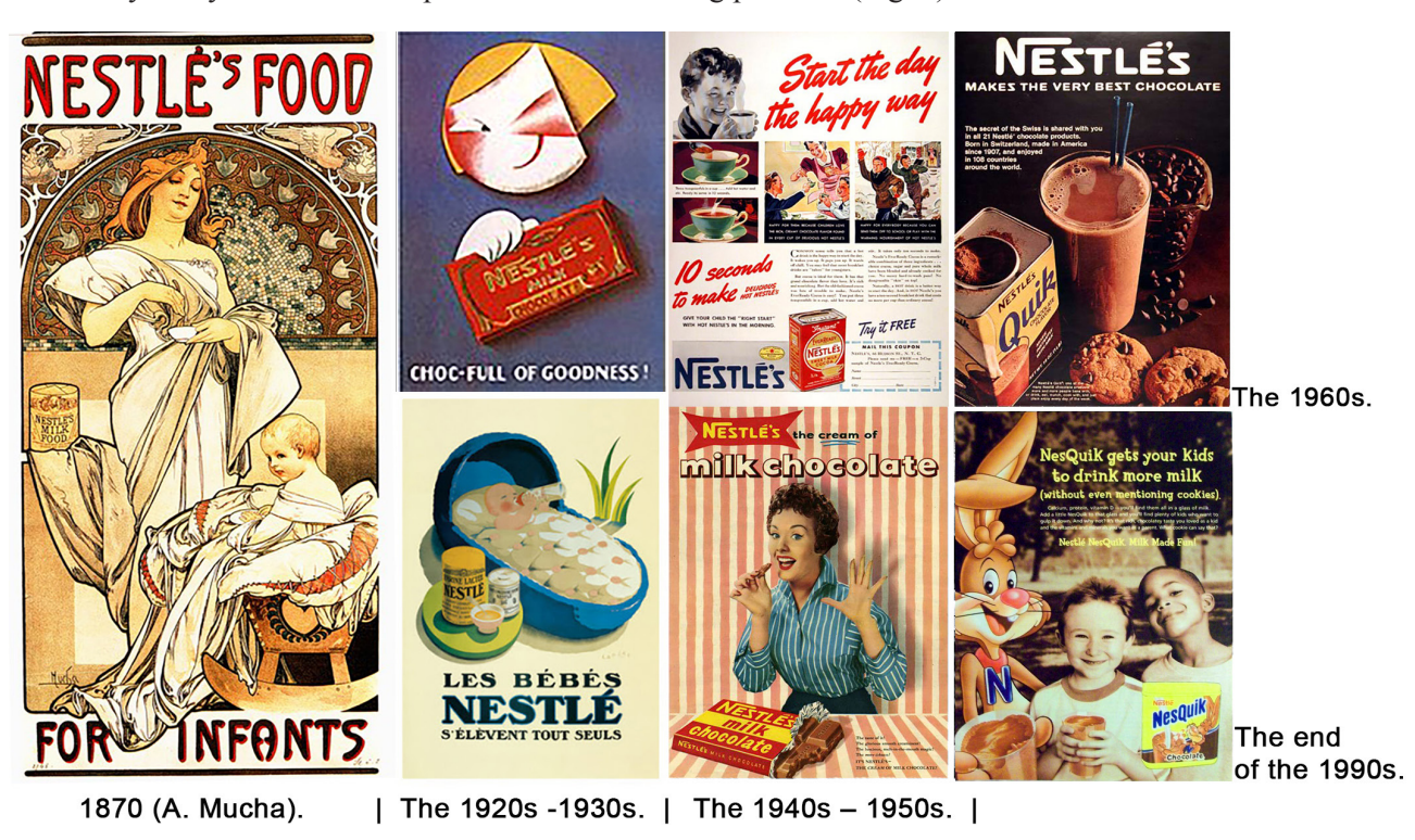
Figure 6. Stylisation evolution of Nestle advertising posters

So, in each historical period, one can determine the characteristics of the visual system of commercial advertising posters, which reflect the most typical features of the artistic style that dominated through the visual arts and design. Some well-known international brands with more than a century of history can demonstrate the history of styles on the examples of their advertising products (Fig. 6).