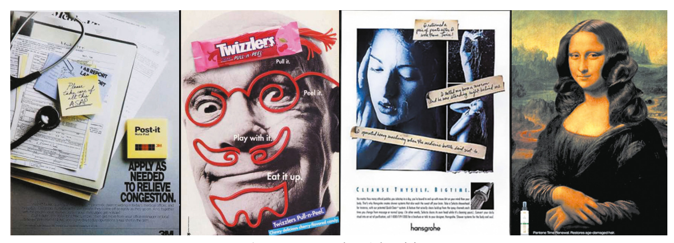
Figure 5. Postmodern Advertising Posters

In the context of Postmodern interests in culture, advertising was interpreted by scientists and practitioners as a component of culture; it has become interested not only in terms of its significance in the economy and the search for effective methods to increase commercial benefits but also for artistic creativity – as an element of everyday aesthetics, an influential factor in human lifestyle. Increasingly, the visual nature of advertising affected artistic works or became the raw material for the latest collage and artistic techniques.