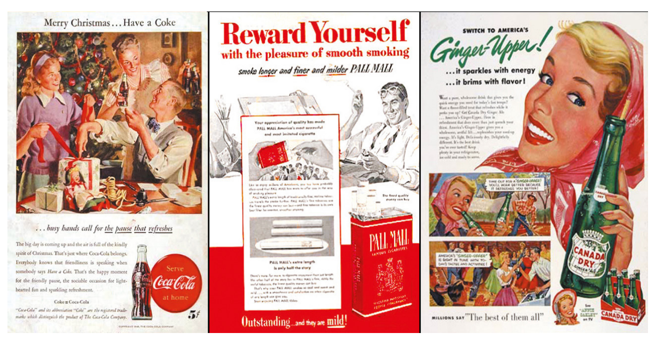
Figure 3. Post-war Modern Advertising Posters

The 1940s and 1950s. During this period, the development of European print advertising had an echo of the traditions of artistic culture and the fine art of the last century. The message of European advertising encoded mainly in graphic forms. The images took 90-95% of the total information plane. One of the leading places in the overall process is won by American print advertising. In contrast to European advertising, product copies became more critical in American advertising. America is a country of copywriting, and the tendency to fill posters with large product copies also comes from the previous century.