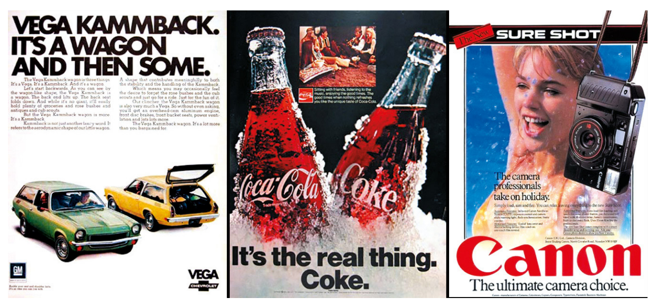
Figure 4. Post-War Modern Advertising Posters

This period was marked by the flourishing of the Swiss International Style in graphic design, which was equally evident in a different field. However, other national schools played an important role in connecting standard parameters with national features. It should also be noted that there was a certain distinction in advertising products: if the entertainment line has a bold abstraction from the real life, then the commercial and trade direction had it.