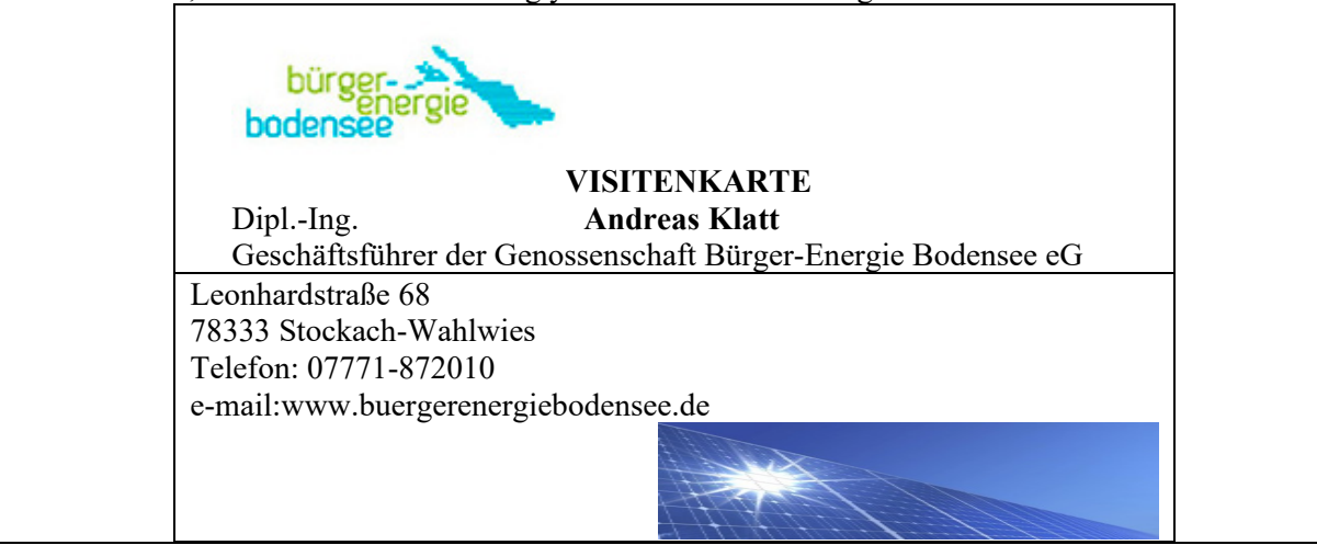
Figure 2. Mini-project fragment "Business Card".

Implementation condition: Check out the business card of the head of "Centre of Bioenergy". Working in pairs, describe the energy specialist on the basis of the data specified in the business card. Create a personal business card, indicating surname, first name, position, place of work, address of the institution, contact details. Presenting yourself to future colleagues.