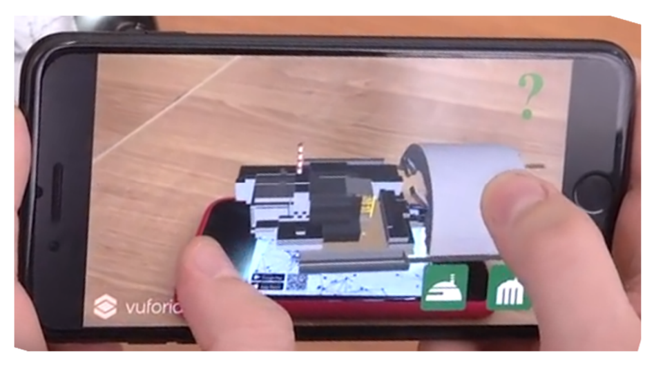
Fig. 1. Use example of application Chornobyl NPP ARCH AR

Application AR APP Chornobyl NPP ARCH AR [9] was officially launched in 2018. It can also be used for educational purposes (Fig. 1). According to the State Agency of Ukraine on Exclusion Zone Management this application helps to take closer look at the construction of the Arch and the Shelter object on a smartphone. You can look at the various details and get a real picture of the little things about the Shelter without risking human health. Its example is shown in fig. 1. It should be emphasized that in the such applications can be used to increase efficiency of emergency preparedness, response system and emergency situations on potentially hazardous sites. Such applications can be used to educate students in preparation of future specialists in the field of ecology and environmental protection. Also, new methods, algorithms and software need to be developed to address environmental security issues in areas of impact of potentially hazardous sites [5; 53; 54; 52; 63].