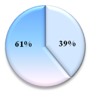
Fig. 3. Results of the questionnaire aimed at assessing the formation of critical thinking and knowledge of hemodynamics of Physical Education teachers, who studied without the use of digital hemodynamic models (control group).

In the control group, which consisted of 75 people, hemodynamics studied without the use of digital hemodynamic models, the results are presented in Figure 3. The experimental group consisted of 82 people; the results are presented in Figure 4. The study of hemodynamics in this group was conducted both through the use of digital hemodynamic models and applying the techniques used in the control group.