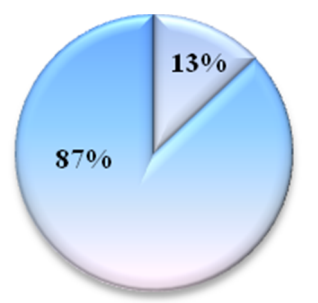
Fig. 4. Results of the questionnaire aimed at assessing the formation of critical thinking and knowledge of hemodynamics of Physical Education teachers, who have used digital hemodynamic models in training (experimental group).

As a result of the questionnaire aimed at assessing the formation of critical thinking and knowledge of hemodynamics of Physical Education teachers, the following results were obtained: teachers who studied without the use of digital hemodynamic models the number of correct answers is 61%; teachers who have used digital hemodynamic models in training have correct answers of 87%. So, the difference in correct answers between the two groups is 26%. As can be seen from Figure 3 and Figure 4, improving critical thinking and developing knowledge of the hemodynamics of