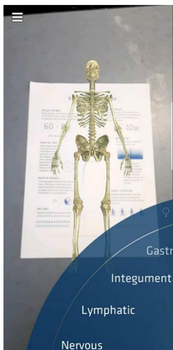
Fig. 2. Example of using AR in education

Google is working with a number of partners, including: WNET, PBS, Houghton Mifflin Harcourt, the American Museum of Natural History, the Planetary Society, David Attenborough with production company Alchemy VR and many of the Google Arts & Culture museum partners to create custom educational content that spans the universe. With over 300 Expeditions currently available, the content touches on a wide range of subjects including historical landmarks, natural wonders, college campuses, careers and more [1].